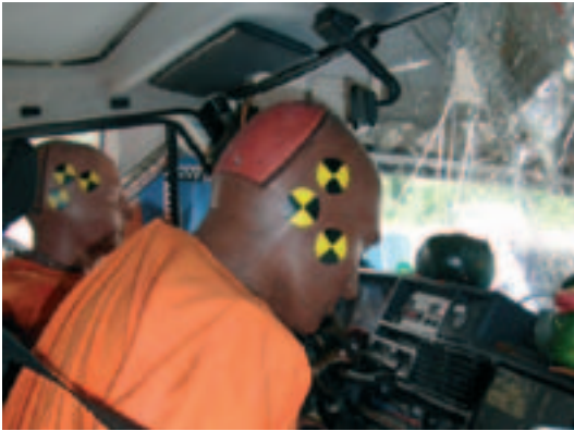
Car crash (on board)