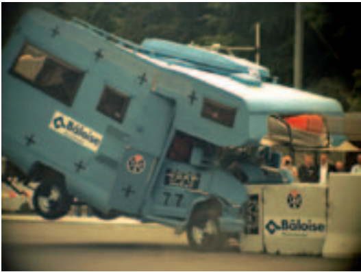
Car crash (off board)