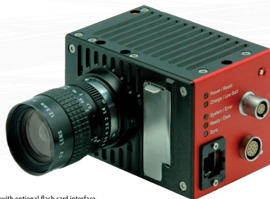
Q-MIZE HD v2 90° with optional flash card interface